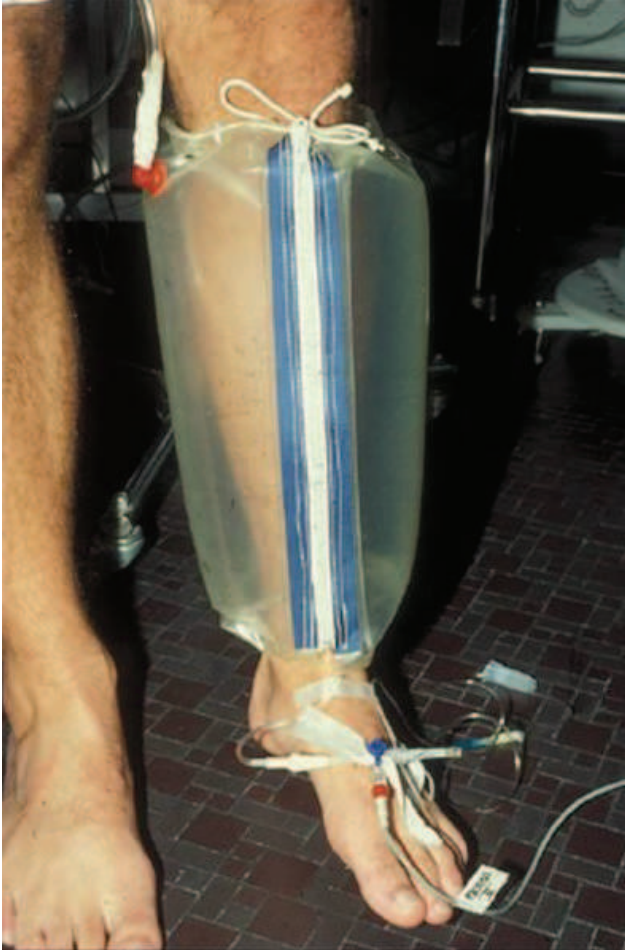
Figure 2 - Air plethysmography and ambulatory venous pressure can be performed at the same time as the tip toe movements for both tests are the same (adapted from Raju et al 4 )

The following parameters were obtained: venous volume (VV), venous filling index (VFI 90 ), ejection volume (EV), ejection fraction (EF), residual volume (RV), RVF and calf volume recovery time (RT).